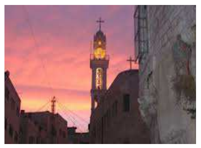
Jerusalem, The Dead Sea, & Bethlehem Jerusalem