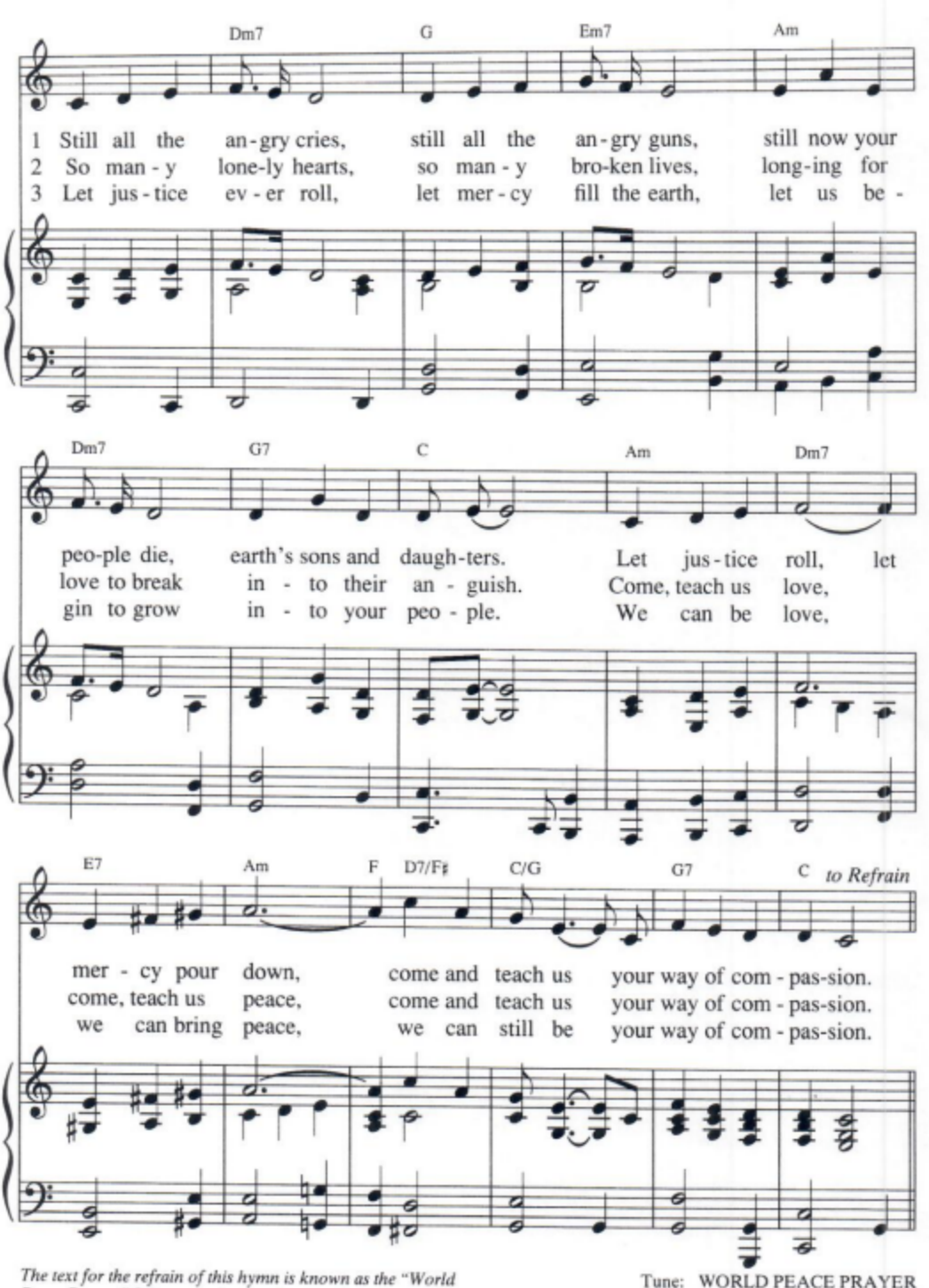
The text for the refrain of this hymn is known as the "World Peace Prayer." It is a paraphrase of a verse from the Upanishads, the most ancient scriptures of Hinduism. Since its introduction at a service in Westminster Abbey on Hiroshima Day, 1981, the prayer has been translated into numerous