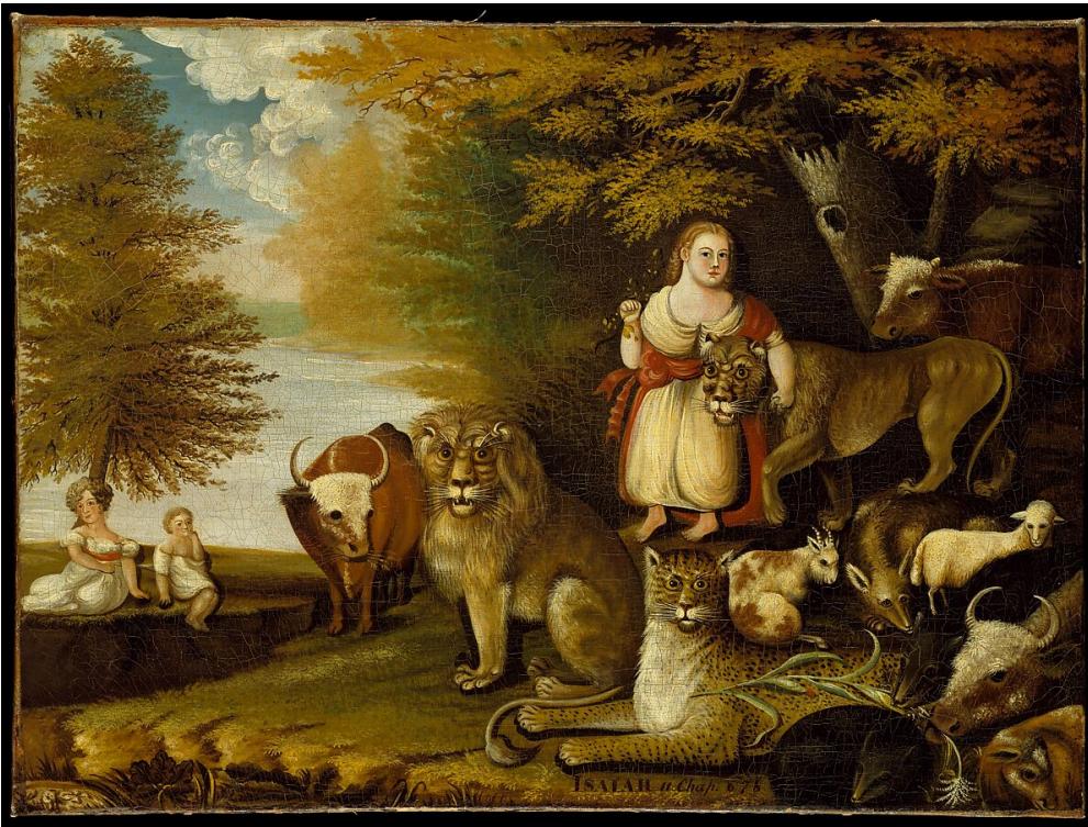
Peaceable Kingdom, Edward Hicks, 1830-32, Oil on Canvas, The Met Museum, NY

–Arundati Roy, Indian activist and writer